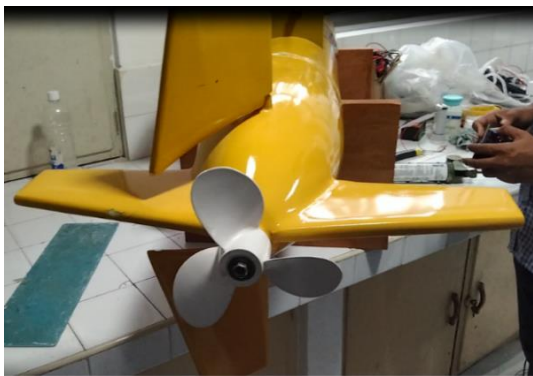
Figure 5: Rudder testing at hydrodynamics laboratory, KDU

The improved maneuverability is one of the main concerns in the development of KDU AUV (version 1). With identified loopholes in previous designs, KDU AUV (version 1) is designed with two GRP-made spade type rudders, which are capable to generate adequate lift to maneuver the vessel even against strong wave conditions. Further, improved response to the command is another cause of improved maneuverability of our design. These rudders are operated with linear actuators and capable of changing its course as per the given command by the rudder control system. However, the fixed planes provide stability to the vessel.