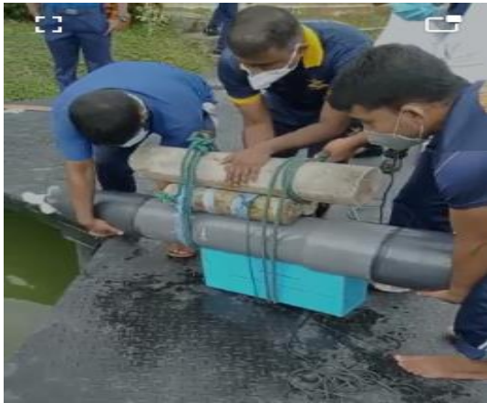
Figure 4. Preliminary stability testing at KDU lake.

neutrally equilibrium condition even in extreme wave conditions. The constructed vessel was tested at sea and KDU swimming pool under varying wave conditions to ensure safe operations in both sea and freshwater conditions.