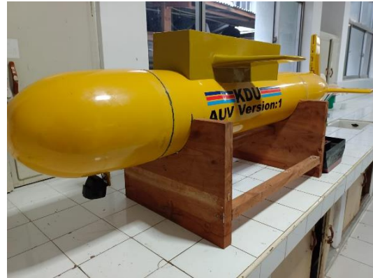
Figure 6. Illumination device

KDU AUV (version 1) is equipped with 12V waterproof light to provide illumination required for shallow-water exploration (Leathermen & Leatherman, 2017). For the version I, we have used a basic light considering the cost-benefit and it is installed at the forward underwater surface of the vessel with a fixed mounting.