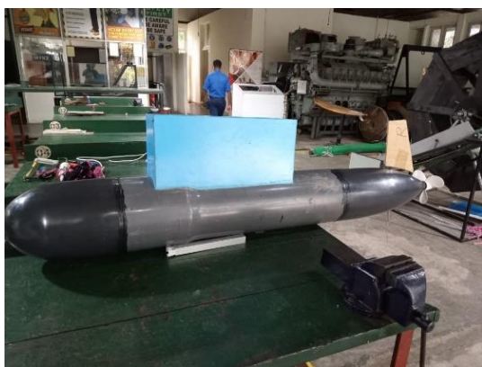
Figure 1. Construction of AUV hull by PVC pipe

The AUV KDU (version 1) is comprised of a 22 cm diameter PVC pipe as the middle part of the spherical body and GRP nobs are fitted with either side of the PVC pipe to minimize water resistance during forward movement and to get the standard shape of the AUV (Alvarez, et al., 2009). Further, components of the hull are easily detachable and maintainable. The PVC hull and anticorrosive marine paints applied on the hull provides complete hull protection against corrosion. Watertight integrity and dryness inside the hull are of paramount importance in AUV operation, which is achieved by simple mechanical fastenings.