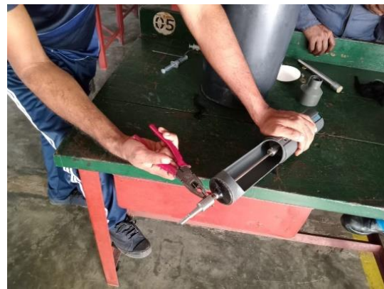
Figure 2. Preliminary stages of construction of AUV

A three-baled propeller is fitted with an electrically driven motor to propel the vessel. The propulsion mechanism is positioned in a way to minimize noise interference with other electronic components and propeller-to-hull interactions. Therefore, avoids unwanted impacts on the hydrodynamics of AUV. With this propulsion system, the speed of the vessel can be varied by a wireless remote controller, overriding the function of a conventional AUV and optimizing its capabilities in rough sea conditions. Figure 2 and Figure 3 depicts the preliminary stages of construction of AUV.