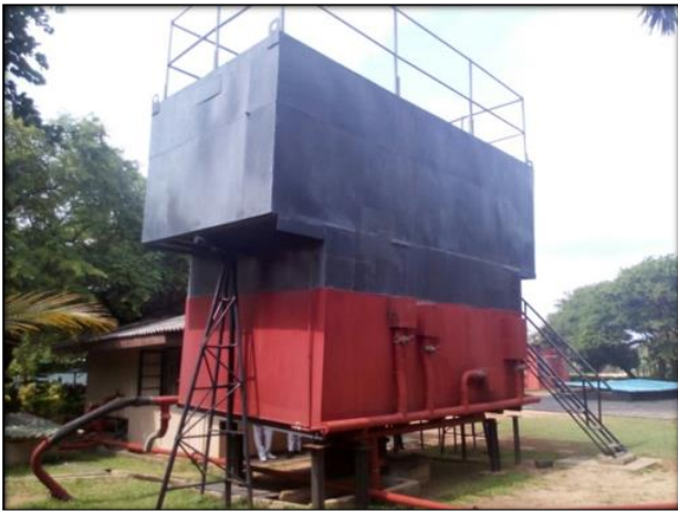
Figure 2: Static Damage Control Simulator