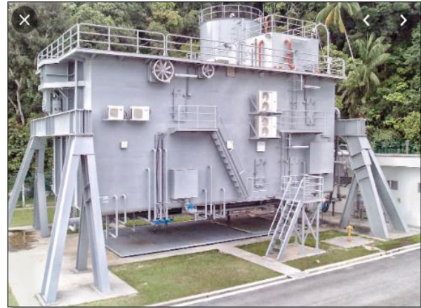
Figure 1: Damage control simulator, Malaysian Navy

The Damage Control Simulator (DCS) is fundamentally a training method that simulates a realistic and stressful, nevertheless a controlled environment for crew training in ship damage control and repair in various damage scenarios (Bulitko and Wilkins, no date b). Further, DCS can be utilized for crew training in both war and peace times equally. Subsequently, to encompass the damage and save the vessel, the crew needs to be able to respond to the threat with efficiency, expertise and confidence gained from training in similar situations. The realistic damage scenarios and crisis generated in the DCS contributes invaluable in driving away fear among the trainees and in improving team building traits, thereby preparing them for unforeseen hardships and emergencies at sea.